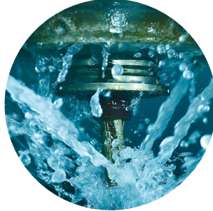
Proven Metalworking Solutions