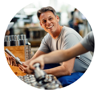
Continuing Service & Support